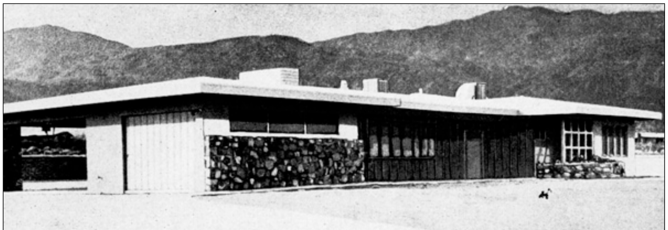
“Architecturally and structurally, this 3-bedroom residence in Shadow Mountain Estates has exceptional appeal.”